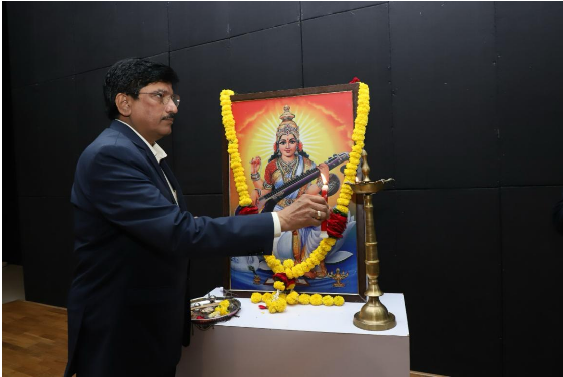
Dignitaries lighting the ceremonial lamp to mark the inauguration of the Student Induction Program