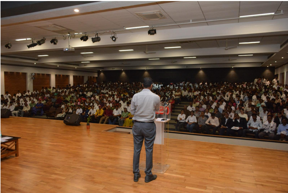
Students and Parents attending Induction Program.