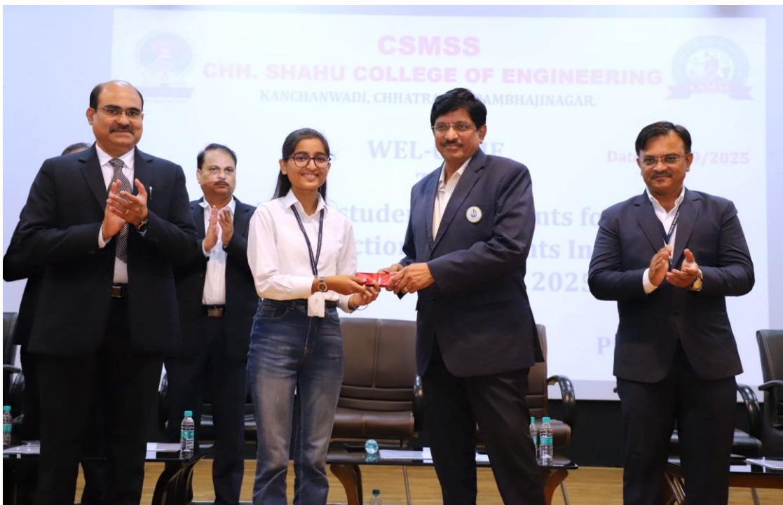
Felicitation of toppers (First Year Students. Batch 2024-2025)