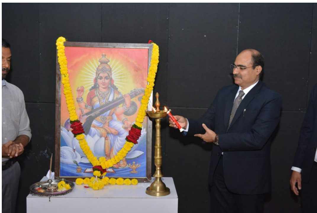
Dignitaries lighting the ceremonial lamp to mark the inauguration of the Student Induction Program