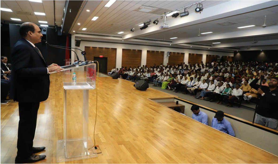
Students and Parents attending Induction Program.