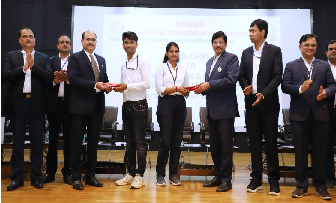
Felicitation of toppers (First Year Students. Batch 2024-2025)