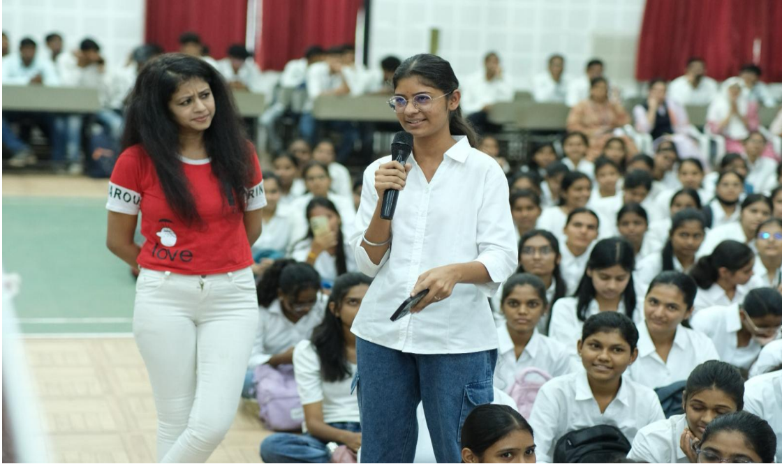
Students showcasing their talent through the cultural program