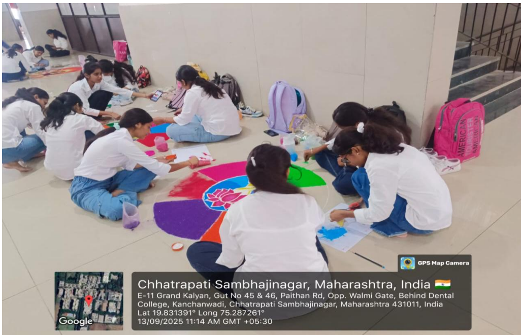
Students expressing social awareness and environmental conservation through rangoli art