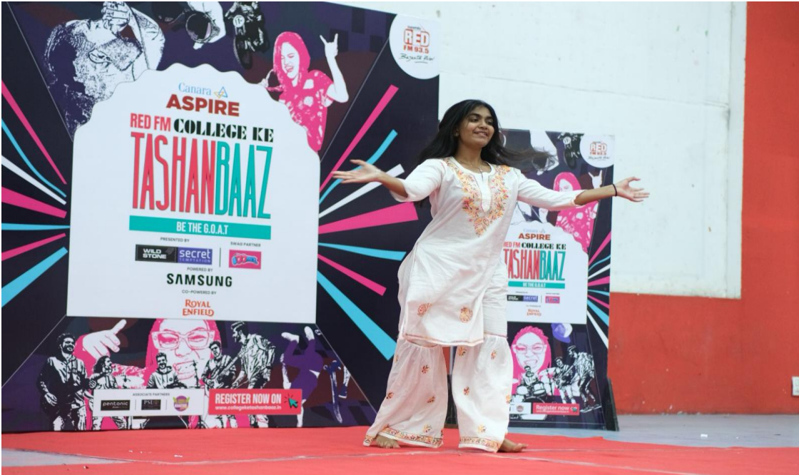
Cultural performances reflecting talent, creativity, and team spirit of the students