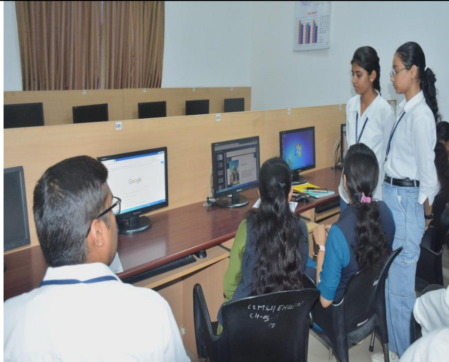
Students explaining the Significance of Museums to Judges on the eve of International museum week 2025 at Computer Center.